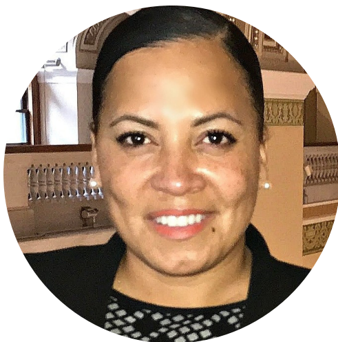
RACHAEL ROLLINS Democratic Party Nominee