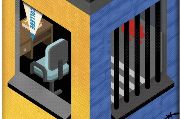
GORDON STUDER FOR THE BOSTON GLOBE

Moreover, our social expectations for this age group have changed dramatically in recent decades. Marriage, parenthood, and steady work — milestones that correlate with big drops in criminal activity and other reckless behavior — come much later than they once did.