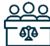
Parole Board (appointed)