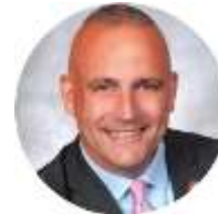
Tim Whelan (Republican)