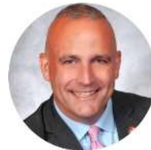
Tim Whelan (Republican)